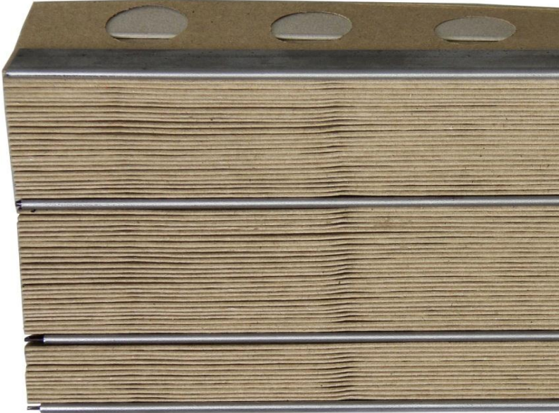
METAL STRIP DETAIL

Vefim S.r.l. reserves the right to update without notice the characteristics described above. This document may not be reproduced, transcribed, or translated (in part or in full) without specific written permission by Vefim S.r.l as provided for by law.